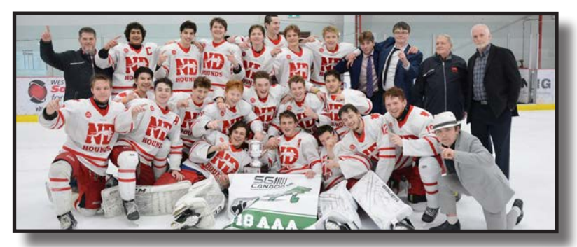
NOTRE DAME HOUNDS • 2021/22 SMU18AAAHL Provincial Champions