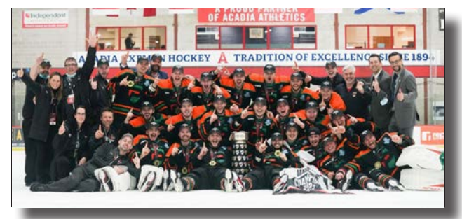
UNIVERSITE DU QUEBEC A TROIS-RIVIERES PATRIOTES • 2021/22 University Cup Champions

For more information on U Sports, you can visit http://www.usports.ca